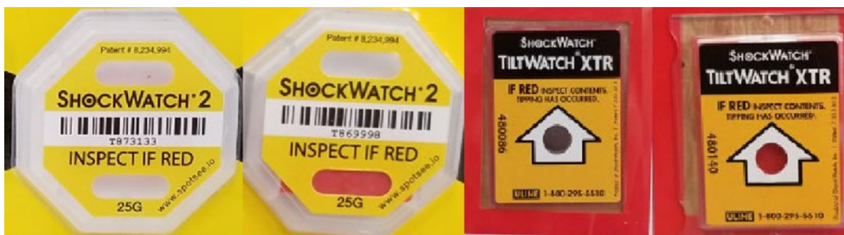
Figure 2. (from left to right) shock-impact sensors (un-triggered and triggered) and tip-tilt sensors (un-triggered and triggered)

An authorized service provider delivers the system. Make sure that the crate is stored securely near the installation lab bench. The instrument has two tip-tilt indicators mounted to the outside of the crate as well as one impact-shock indicator (see Figure 2 ). Please inspect the exterior of the crate for damage and inform the Field Service Engineer (FSE) if either one of the two tip-tilt sensors, or the shock-impact sensors have been triggered.