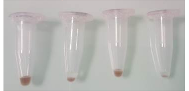
Figure 4. Image of tubes containing brown DNA samples.