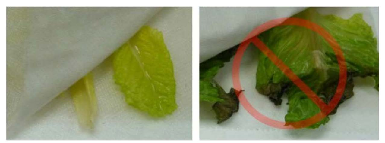
Figure 2. Images of fresh young leaves (left) and bruised leaves (right).