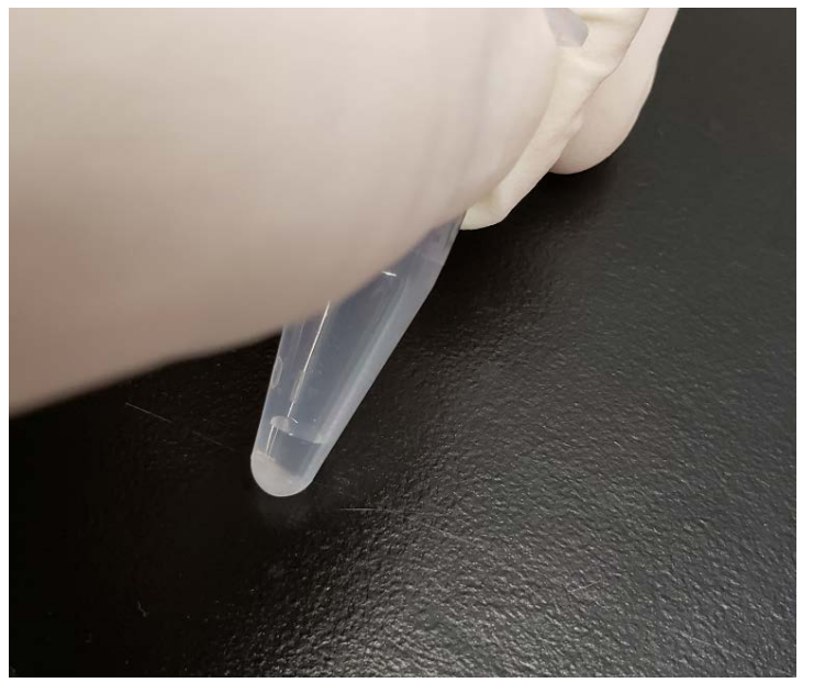
Figure 3. Image of tube containing white or opaque DNA. Possible causes: